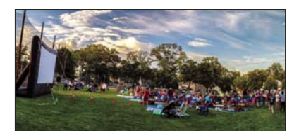
MOVIE NIGHT... Incredibles 2 will show Tuesday night at La Grande Park in Fanwood.

FANWOOD -- Tuesday, August 6, at 8:15 p.m. the Fanwood Recreation Department will show Incredibles 2 as part of its free summer movies in the park series, held in La Grande Park. Be sure to bring a blanket or a low back chair. The film is Rated PG.